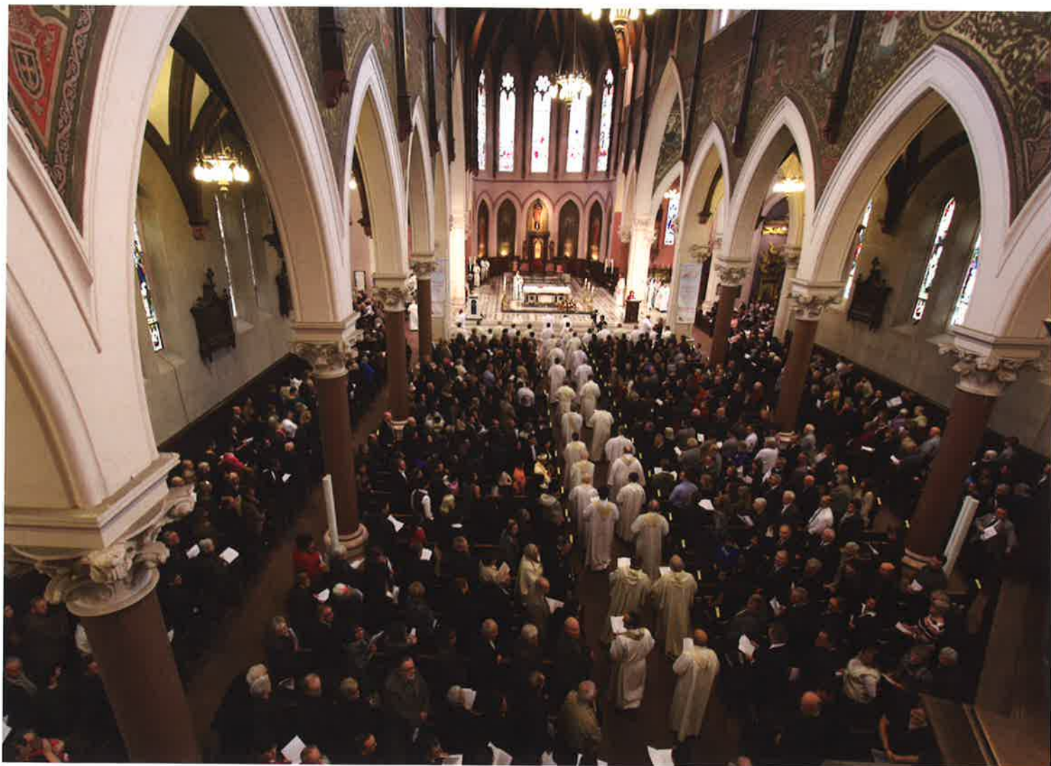
Ordination of Permanent Deacons, 18 November 2013, St. Peter's Basilica, London

ats The Association of Theological Schools The Commission on Accrediting